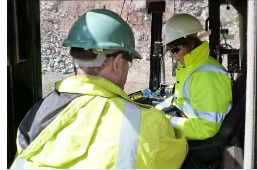
Safety on site from top management to employees, contractors, haulers and visitors Instruction given on driving engines, before talking with drivers on safe and sustainable driving.

on the other, of innovative, safe and sustainable initiatives to reach a company's sustainable cultural behaviour.