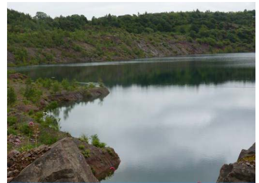
New habitats and nature protection zones Rehabilitated Boon quarry in the Midlands, UK