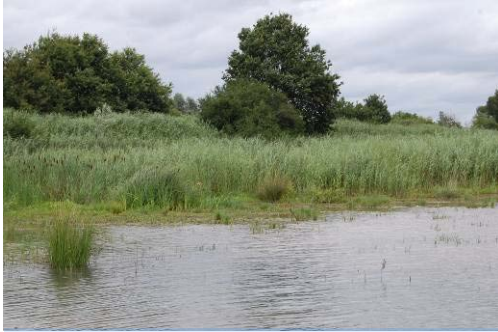
Published in the UEPG Biodiversity Database The Holcim Sand and Gravel pit Faverny, France created a high diversity of habitats.

Human Resources, Permitting and Environment.