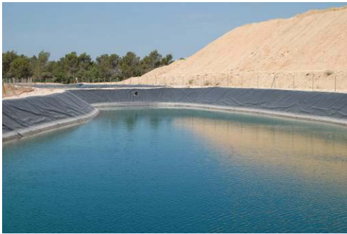
Excellence in Innovation and Sustainability The Lafarge quarry next to Signes is an outstanding example on sustainable management.

Both companies explained the challenges aggregates producer are currently facing and showed strong interest in upcoming EU legislation.