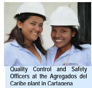
Quality Control and Safety Officers at the Agregados del Caribe plant in Cartagena

On Health & Safety there was strong interest in the Safer by Design project: in Australia, the parallel EMESRT