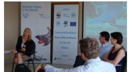
Round-table on the contribution of business to water policies

On 9-10 July 2012, WWF organised a Symposium on "Business, Water and Wetlands". This was an opportunity to discuss how NGOs and business could work better together. WWF presented the excellent cooperation they have with the Bulgarian Aggregates Association BAPIM and it was underlined that companies should promote more their good work.