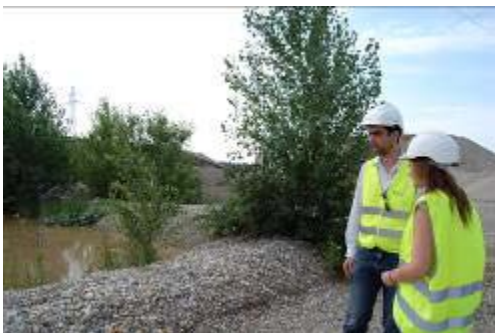
Looking at settling ponds